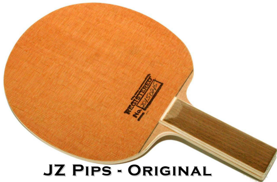
JZ PIPS - ORIGINAL

8 PLY - POPLAR LITE PLY6 CORE WITH DOUGLAS FIR OUTER PLYS. OVERSIZED BLADE FOR TOTAL CONTROL OF YOUR PIPS GAME.