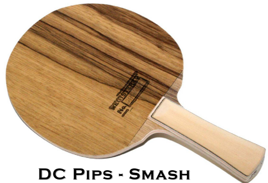
DC PIPS - SMASH

9 PLY - POPLAR LITE PLY6 CORE WITH FASTER BLACK LIMBA OUTER PLYS. CARBON FIBER INNER PLY ON ONE SIDE FOR ADDED SPEED TO YOUR PIPS GAME.