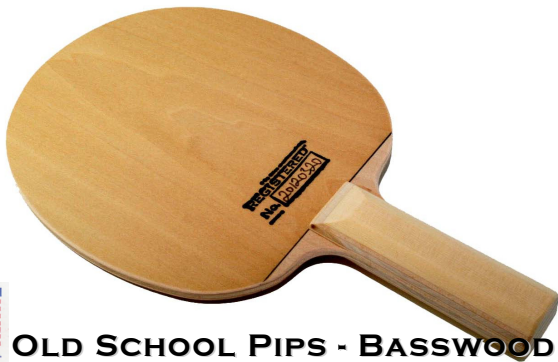
OLD SCHOOL PIPS - BASSWOOD

3 PLY - ALL BASSWOOD CONSTRUCTION “CLASSIC HARDBAT” BLADE. PERFECT FOR YOUR NO SPONGE PIPS RUBBER SHEETS.