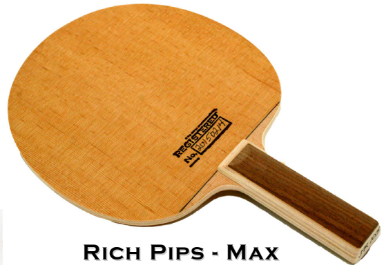
RICH PIPS - MAX

8 PLY - POPLAR LITE PLY6 CORE WITH DOUGLAS FIR OUTER PLYS. LIKE THE JZ PIPS BUT WITH MAXIMUM SIZE BLADE TO MAKE USE OF EVERY PIP ON YOUR RUBBER SHEET.