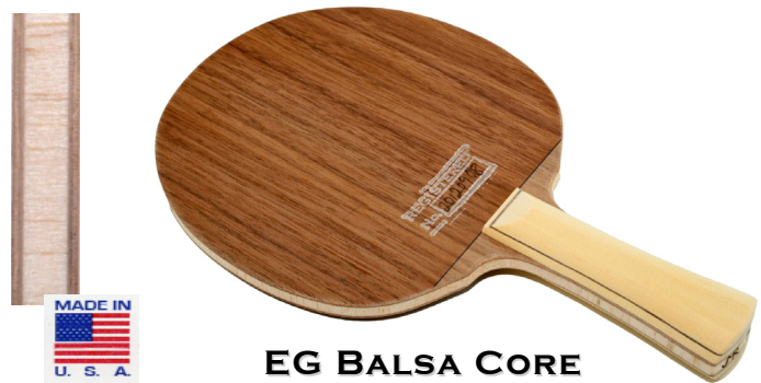
EG BALSAM CORE

OFFENSIVE+ 90 GRAMS(+3) 7MM BLADE THICKNESS