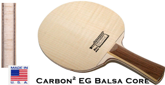
CARBON 2 EG BALSAM CORE

9 PLY - (EG)END GRAIN BALSAM CORE SURROUNDED BY BLACK WALNUT, CARBON, AND RIBBON MAHOGANY PLIES. QUARTERSAWN MAPLE OUTER PLIES TO TOP OFF A STIFF NO FLEX BLADE WITH RELENTLESS SPEED.