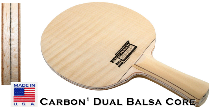
CARBON 1 DUAL BALSAL CORE

OFFENSIVE- 83 GRAMS 8.5MM BLADE THICKNESS