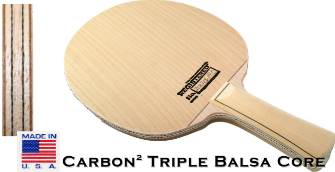
CARBON 2 TRIPLE BALSAL CORE

9 PLY - 2 CLOSE TO THE CORE CARBON PLYS PLUS QUARTERSAWN MAPLE OUTER PLYS FOR STIFFNESS AND SPEED. 3 BALSAL CORE PLYS HELP MAINTAIN CONTROL AND FEEL EVEN WITH CARBON SPEED.