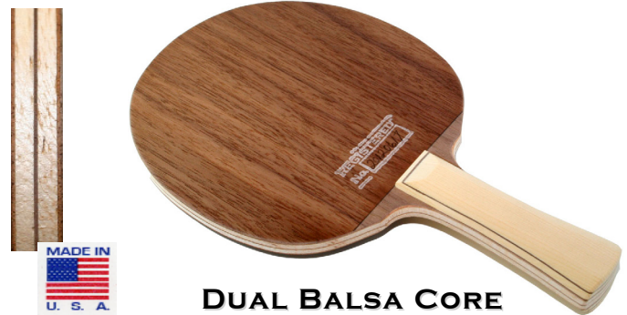
DUAL BALSAL CORE

7 PLY - SINGLE BLACK WALNUT CENTER PLY SURROUNDED BY 2 BALSAL CORE PLYS WITH BLACK WALNUT OUTER PLYS FOR FLEX AND FEEL IN A LIGHT WEIGHT BLADE.