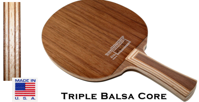
TRIPLE BALSAL CORE

9 PLY - 3 BALSAL CORE PLYS SEPERATED WITH RIBBON MAHOGANY GIVES SPEED WITHOUT CARBON. BLACK WALNUT OUTER PLYS TO MAINTAIN FEEL.